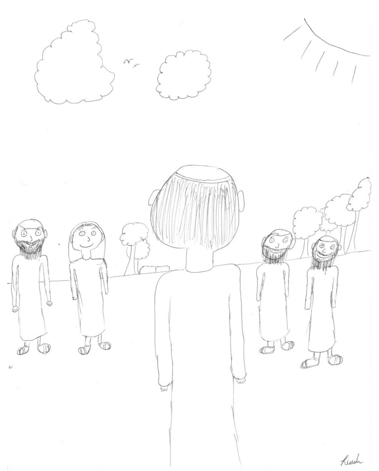
Moshe teaching Israel